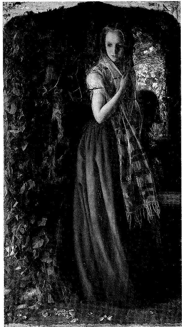
April Love , 1855. Arthur Hughes. Oil on canvas, 88.9 x 49.5 cm. Tate Gallery, London.

When her lover turned and looked at her, and his eye met hers as she sat there paler and whiter than any one in the vast ocean of anxious faces about her, he saw, by that power of quick perception which is given to those whose souls are one, that she knew behind which door crouched the tiger, and behind which stood the lady. He had expected her to know it. He understood her nature, and his soul was assured that she would never rest until she had made plain to herself this thing, hidden to all other lookers-on, even to the king. The only hope for the youth in which there was any element of certainty was based upon the success of the princess in discovering this mystery; and the moment he looked upon her, he saw she had succeeded, as in his soul he knew she would succeed.