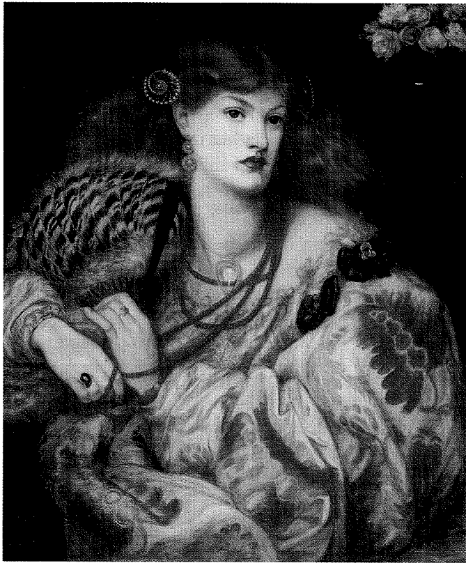
Mona Vanna , 1866. Dante Gabriel Rossetti. Oil on canvas, 88.9 x 86.4 cm. Tate Gallery, London.

The appointed day arrived. From far and near the people gathered, and thronged the great galleries of the arena; and crowds, unable to gain admittance, massed themselves against its outside walls. The king and his court were in their places, opposite the twin doors,—those fateful portals, so terrible in their similarity.